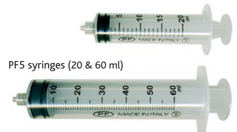
PF5 syringes (20 & 60 ml)