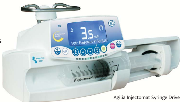
Agilia Injectomat Syringe Drivers