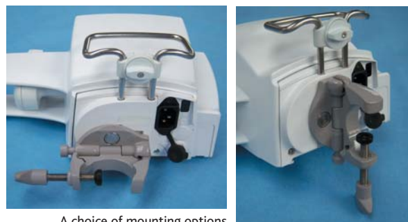
A choice of mounting options

Battery autonomy makes this an ideal pump to use in the field, but it is equally at home in intensive practice delivering precise drug doses and fluid volumes.