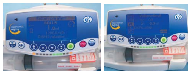
Agilia Injectomat: Simple menu & programme control and clear display panel with easy to follow parameters