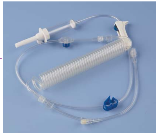
Unique spiral tubing gives improved recoil but allows full extensibility. 390 cm long. Fully infusion pump compatible.