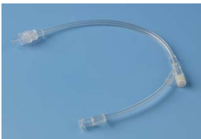
ModuFlo sets are supplied with the rugged short end section as standard

* Use on non-dedicated Baxter Flogard models requires inclusion of the Baxter pump extension (EPUMP-BX) at the proximal luer connection