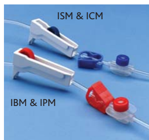
Colour-coded valves, clamps and proximal T port