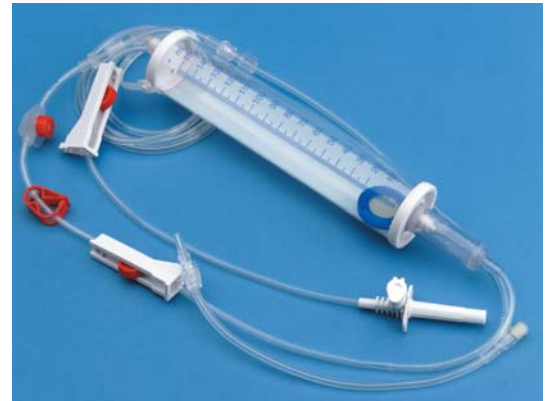
150 ml burette body with handle to hang from same hook as fluid bag.